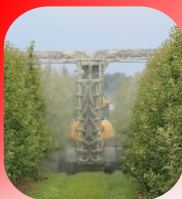
H.S.S. 3 Row Sprayer