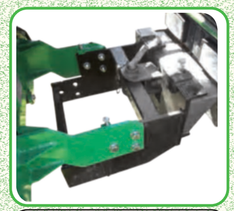
Strong universal flange with 2 modes of connection for secure attachment