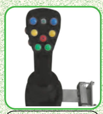
Simple joystick control with up to 7 movements