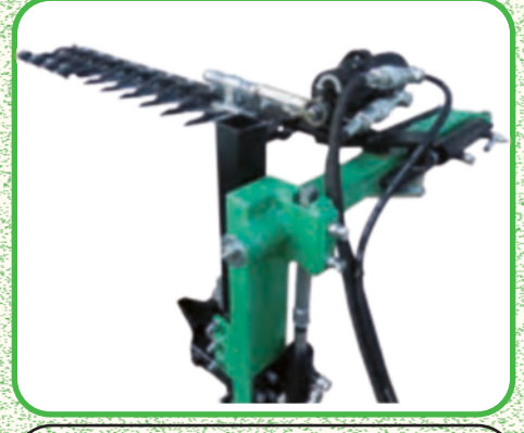
Horizontal topping bar with 90° rotation and spring loaded for safety around posts