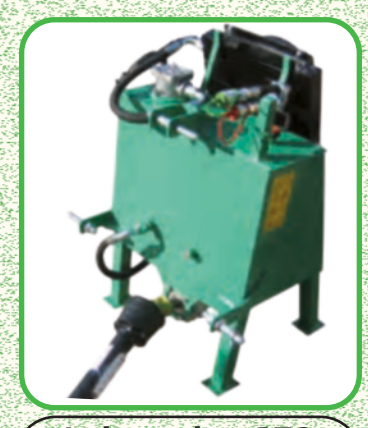
Independent PTO Hydraulic system; pump, heat exchanger, 60 L holding tank