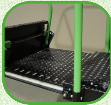
Highest quality 4 step powder-coat paint; Will resist rust even when paint GREEFA packing VAN WAMEL 'Perfect' movers ORSI GROUP platforms FRUIT TEC blossom thinners PULSE INSTRUMENTS water treatment BARTLETT custom mfg