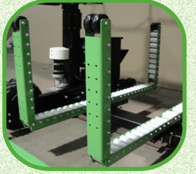
Spring loaded bin carrier -