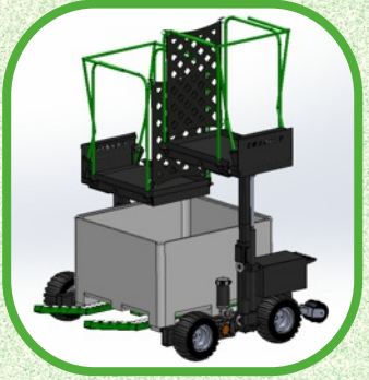
CAD designed, engineer approved

Angle of platform safety bars can be changed with a simple foot switch for further reach/comfort